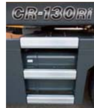
▲ Aluminium side step