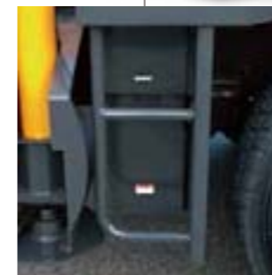
▲ Rear side step