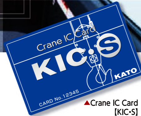
▲ Crane IC Card [KIC-S]

IC Card System ■ Anti-theft function ■ Crane running data ■ Daily reports ■ Connect to PC for daily reporting