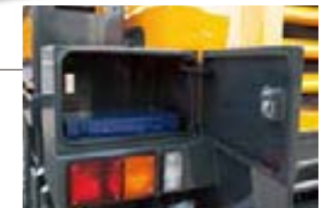
▲ Tool box