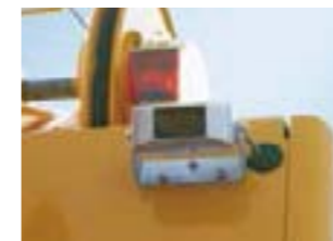
▲ Side view camera (optional)