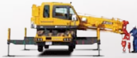
Insert Fly Jib Pins