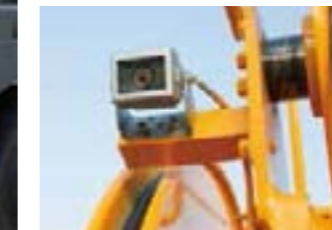
▲ Rear view camera (optional)