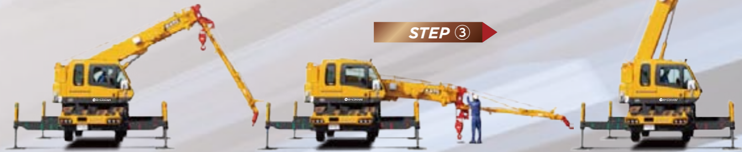
Lower boom and Fly Jib