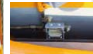
▲ Drum camera (optional)