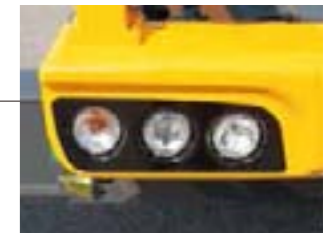
▲ Xenon headlights